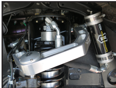
[TECH NOTE #2]

RETORQUE ALL NUTS, BOLTS AND LUGS AFTER 100 MILES AND PERIODICALLY THEREAFTER.